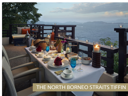
THE NORTH BORNEO STRAITS TIFFIN