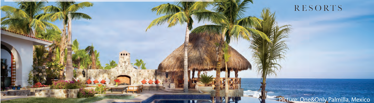
Picture: One&Only Palmilla, Mexico